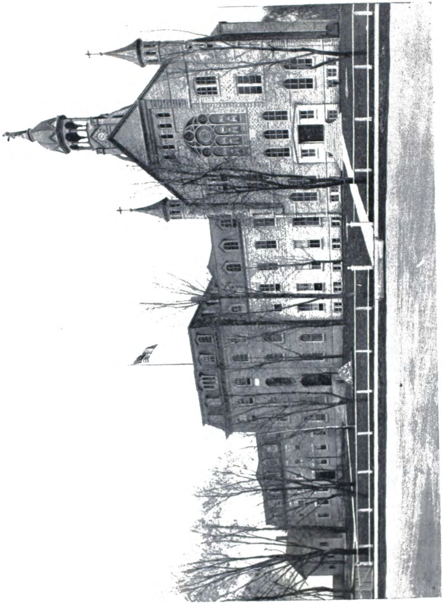
St. Viateur's College.